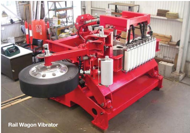
Rail Wagon Vibrator