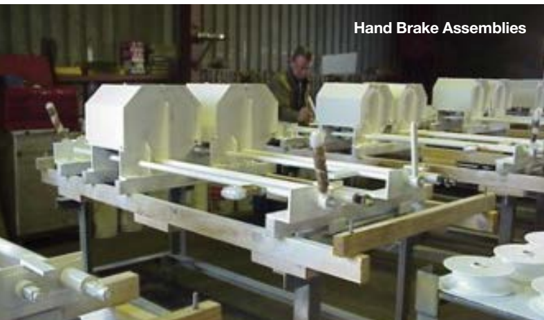
Hand Brake Assemblies